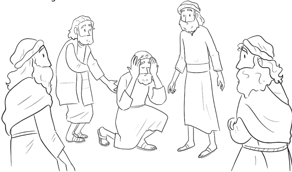
'If only I knew where God had gone,' Job said.

As Job's suffering continues, he wants to talk to God but he cannot find where God has gone.