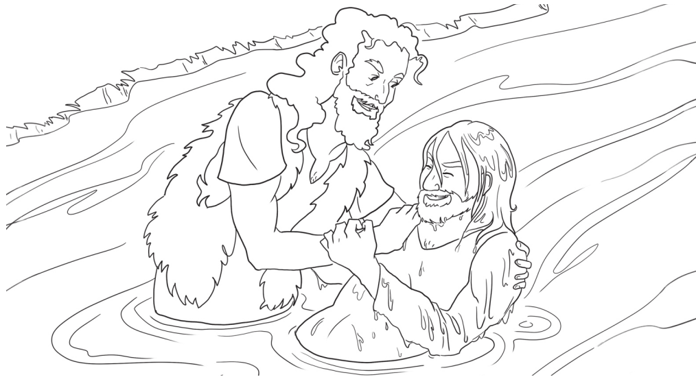
Jesus is baptized by John in the river.

John is baptizing people in the river, telling them about the one who is coming, when Jesus arrives and asks to be baptized too.